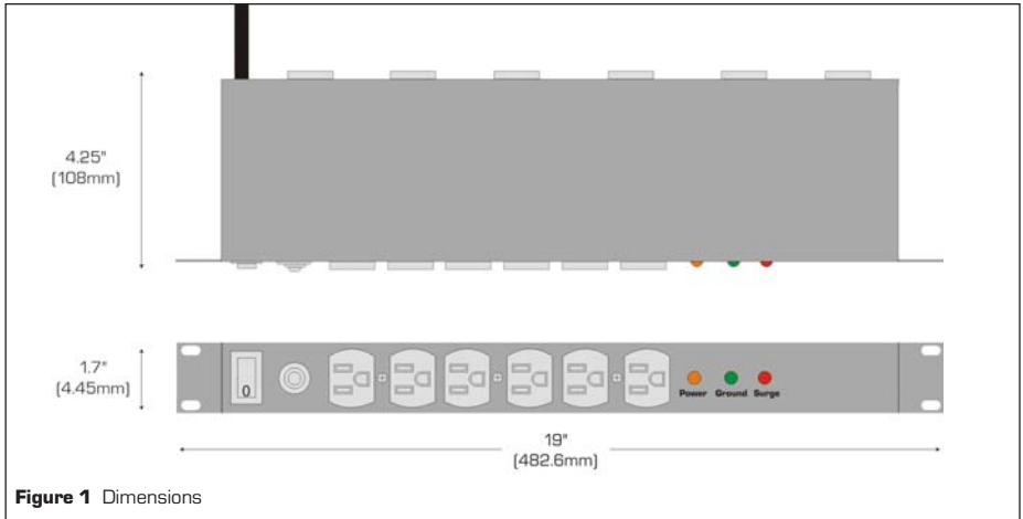
Figure 1 Dimensions