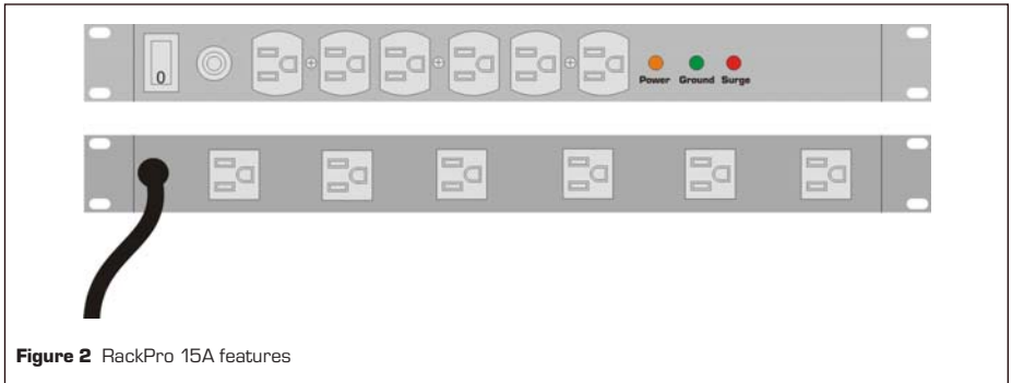
Figure 2 RackPro 15A features